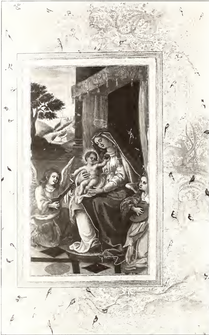
Figure 19. Madonna and Child with Angels , by anonymous Portuguese painter (act. 1595) after Antoon Wierix (Flemish, 1552–1624) after Martin de Vos (Flemish, 1532–1603). India, Portuguese-Mughal period, 1595. Album page: main image, oil on paper, 42 x 26.5. Arthur M. Sackler Museum, Harvard University Art Museums, Gift of John Goelet